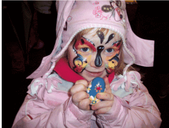
Happy Haddo Bunny